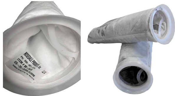
OS Bag Pre-Filtration